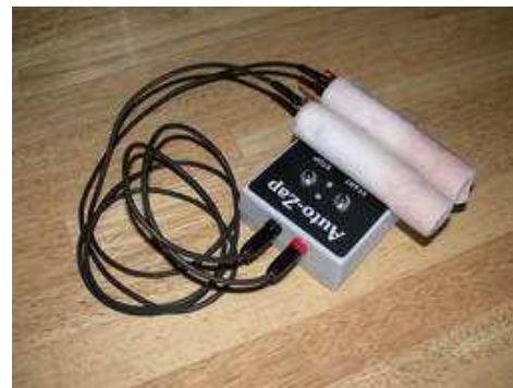
Ready to go