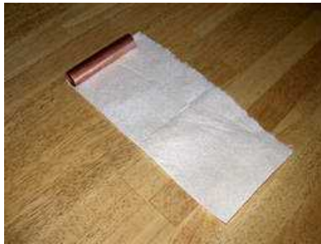
Line up pipe with edge