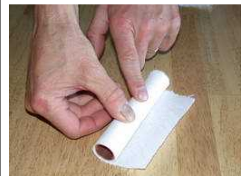
...all the way