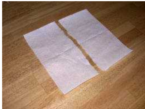
Tear paper in half