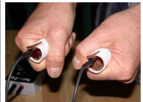
Hold on, press START button