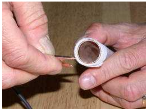
Clip paper onto pipe