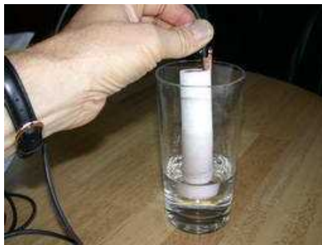
Dip briefly into tap water (no salt!)